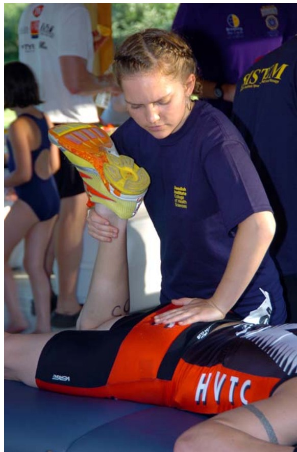
Moments of Greatness with HVTC